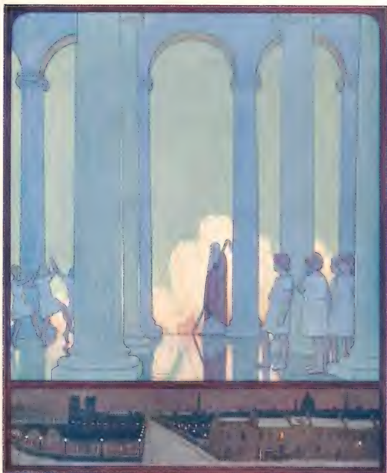
THE KINGDOM OF THE ST. JEE